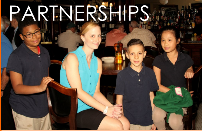
Fels Elementary students presented their donation to ECP at the 2015 Imagine Speaker's Luncheon.

O n May 21, 2015, Need in Deed presented ECP with a Lifetime Transformational Partners Award. It was the first time the award was given and was created to honor organizations that have long standing relationships with Need in Deed and the amazing students and teachers who participate in their Service Learning Projects.